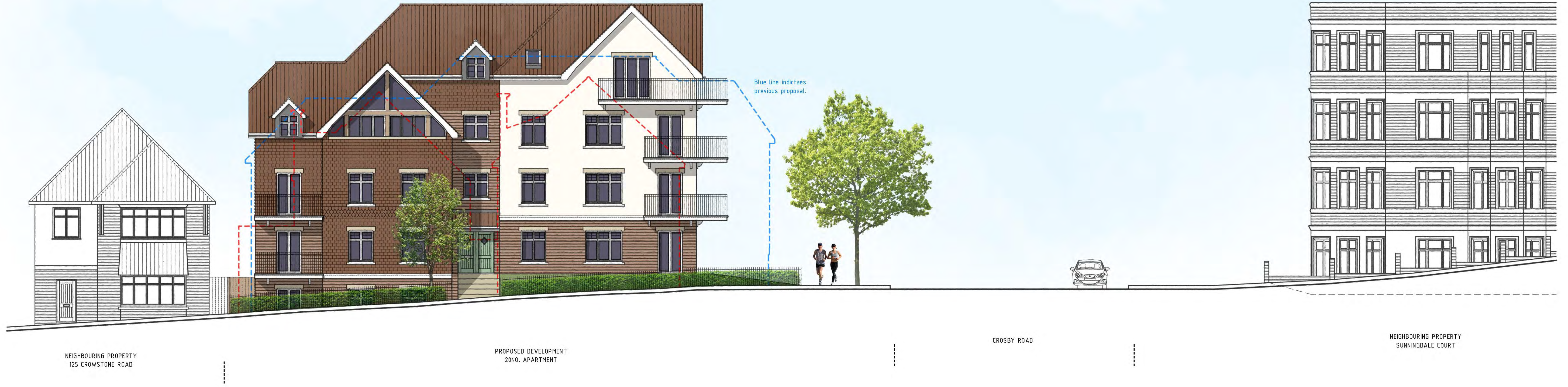
STREET-SCENE AA (ALONG CROWSTONE ROAD).

THE COPYRIGHT IN ALL DESIGNS, DRAWINGS, SCHEDULES, SPECIFICATIONS AND ANY OTHER DOCUMENTATION PREPARED BY DAVID PLANT ARCHITECTURE LTD IN RELATION TO THIS PROJECT SHALL REMAIN THE PROPERTY OF DAVID PLANT ARCHITECTURE LTD AND MUST NOT BE REISSUED, LOANED OR COPIED WITHOUT PRIOR WRITTEN CONSENT. THIS DRAWING IS TO BE READ IN CONJUNCTION WITH ALL ARCHITECT'S DRAWINGS, SCHEDULES AND SPECIFICATIONS, AND ALL RELEVANT CONSULTANTS AND / OR SPECIALIST'S INFORMATION RELATING TO THE PROJECT. REFER ALL DISCREPANCIES TO DAVID PLANT ARCHITECTURE LTD.