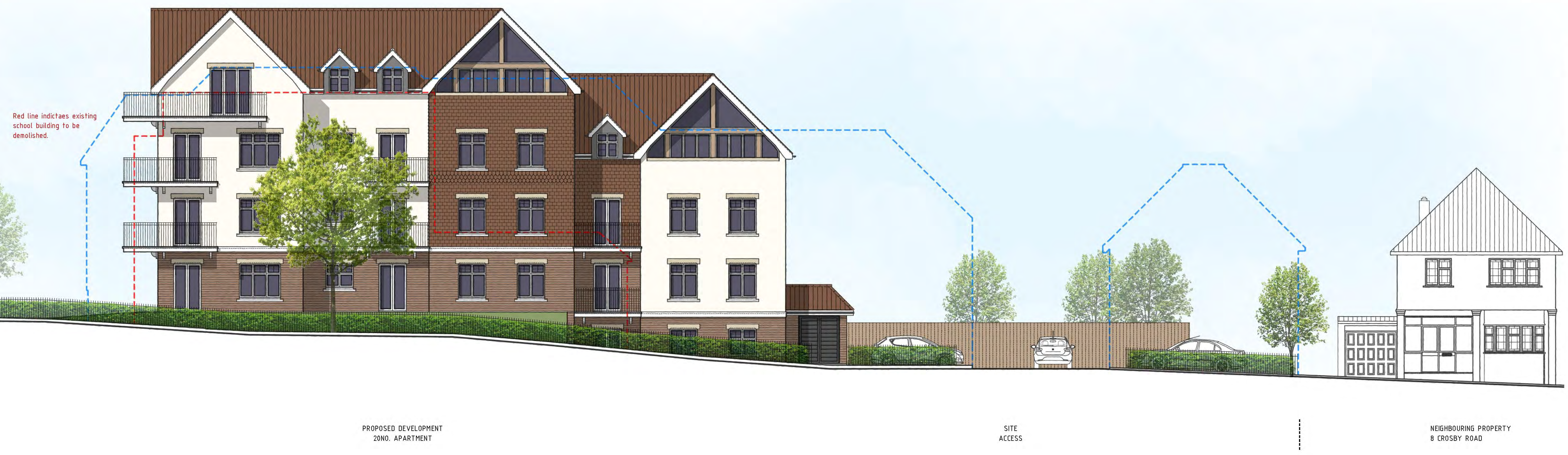
STREET-SCENE BB (ALONG CROSBY ROAD).